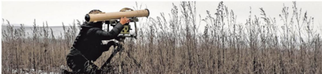
Battle stations: Ukraine soldiers prepare weapon systems near Soledar, Ukraine on January 14.

All sides are gearing up for a major escalation in the conflict. Russia, which suffered some setbacks last year after its initial thrust into Ukraine, is trying to build back battlefield momentum. This has left Ukraine desperately in need of heavier weapons from its NATO allies